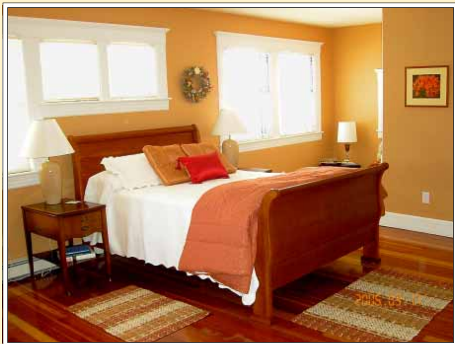
◀ The Foley Room: a large room with balcony, sitting area, and private bath. $195.00 (double occupancy)